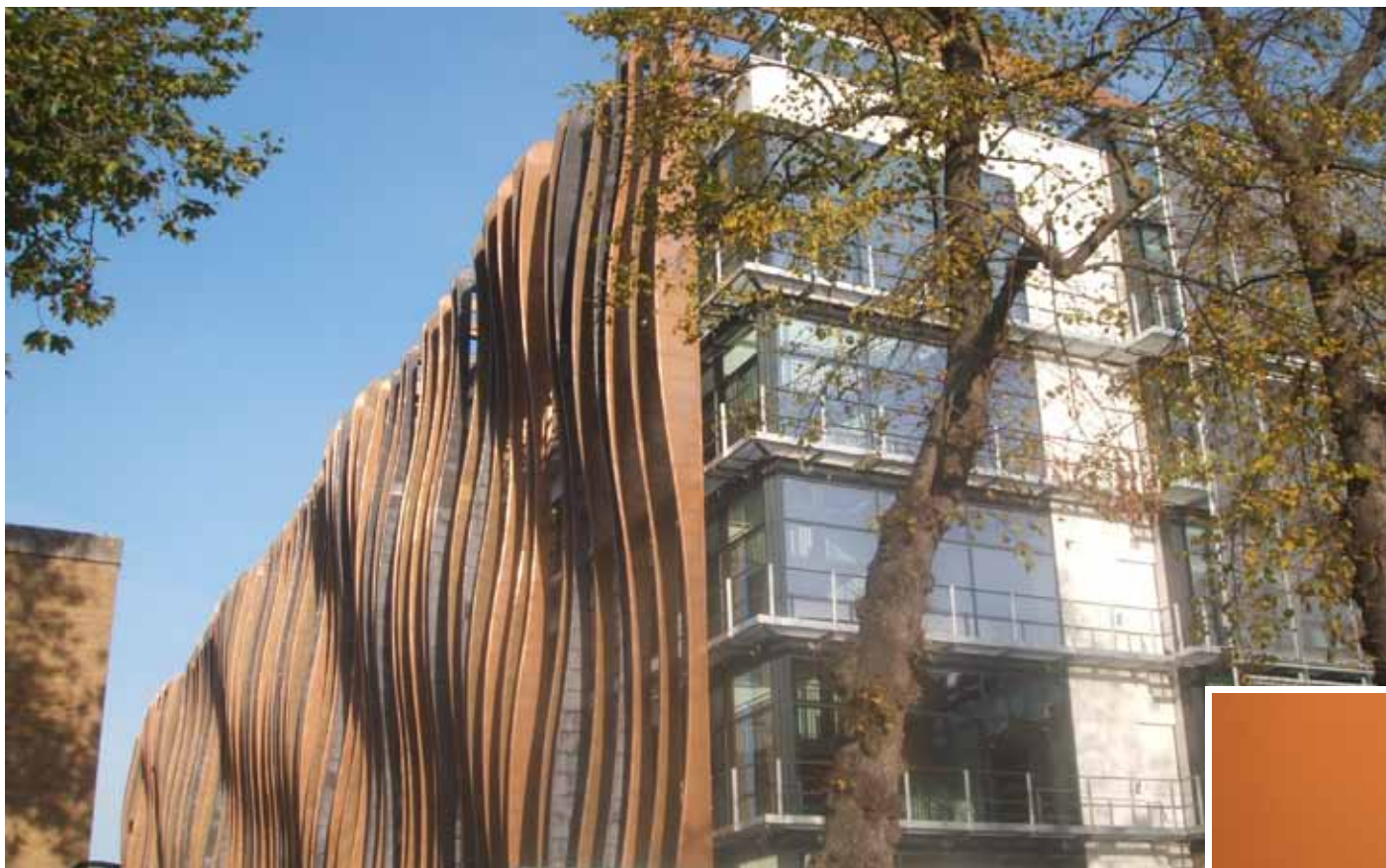
Vertical solar shading fins, each clad in either Nordic Bronze, Nordic Brass or Nordic Brown™. Holland Park School, London; Architects: Aedas.